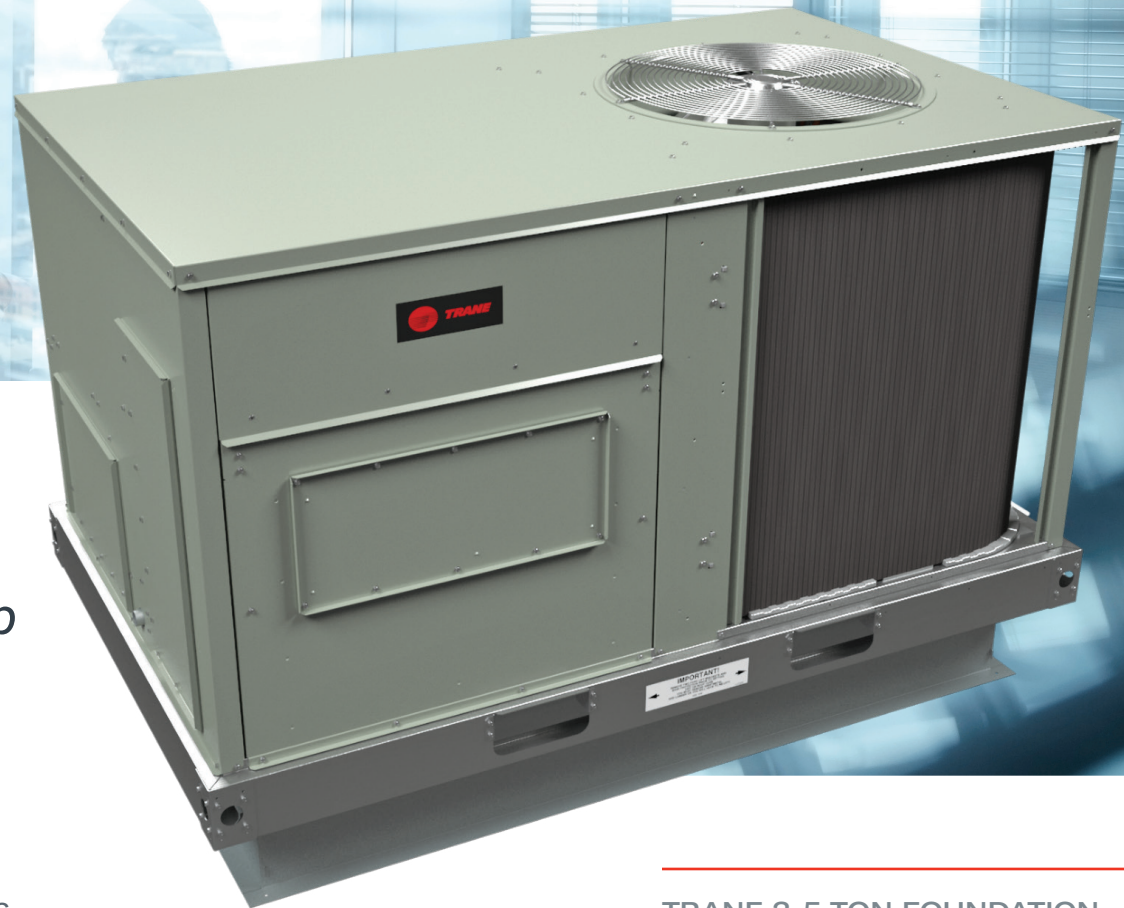
TRANE 3-5 TON FOUNDATION ROOFTOP UNIT